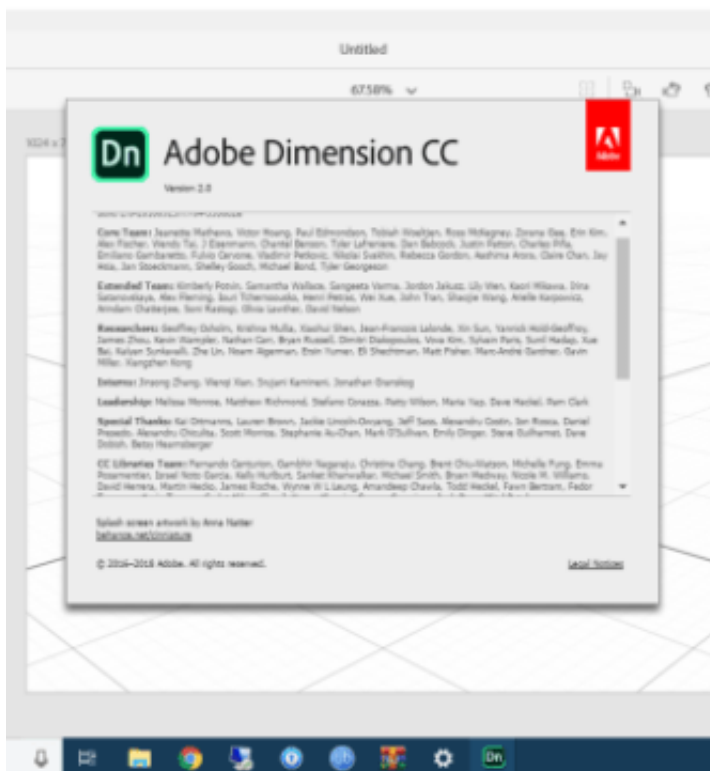
Us Army Flag Patch Placement

Adobe Dimension Cc 2018 Serial Essential ThatAdobe Dimension Cc 2018 Full Version Free OfAdobe Dimension Cc 2018 License Contract EnterThis break tool can be build up by the well respected and trusted developers.. A pop up information will display within few 2nd please link to the web and consider again, After this click on the Connect later. Ge Model Gel-15vd User Manual